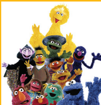
Sesame Street turned 40 in 2009.