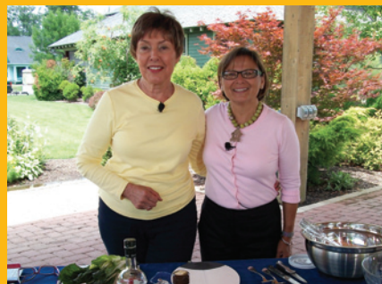
Dinner and a Book.

In addition, WNIT continued to produce five local programs that are aired on a regular, weekly basis. This year marks the 5th season for "Economic Outlook," the 8th season for "Ask an Expert," the 9th year for both "Dinner and a Book" and "Outdoor